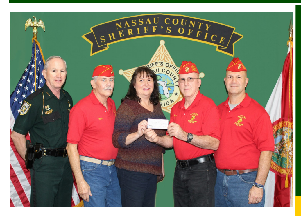
Marine Corps League donates to Nassau County Sheriff's Office Shop with Cops fund