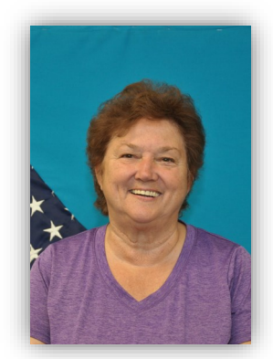
Virginia Green Crossing Guard