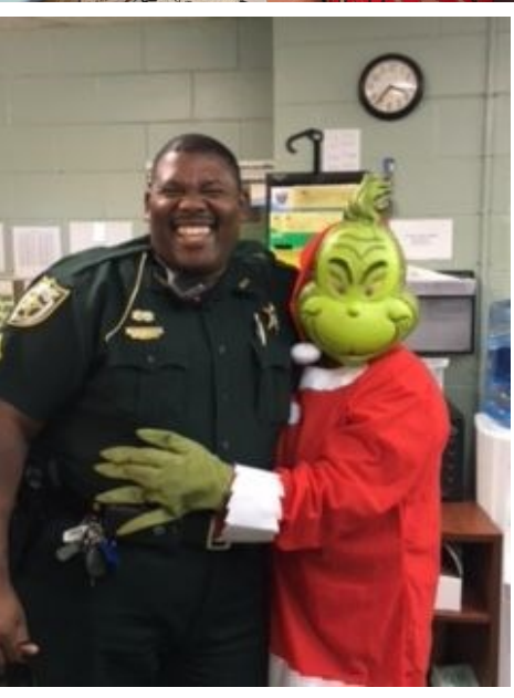
Answers on page 14 UCSS Who?