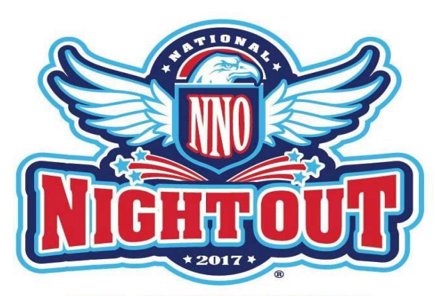
POLICE · COMMUNITY PARTNERSHIPS

National Night Out is an annual community-building campaign that promotes police-community partnerships and neighborhood camaraderie to make our neighborhoods safer, more caring places to live. National Night Out enhances the relationship between neighbors and law enforcement while bringing back a true sense of community. Furthermore, it provides a great opportunity to bring police and neighbors together under positive circumstances.